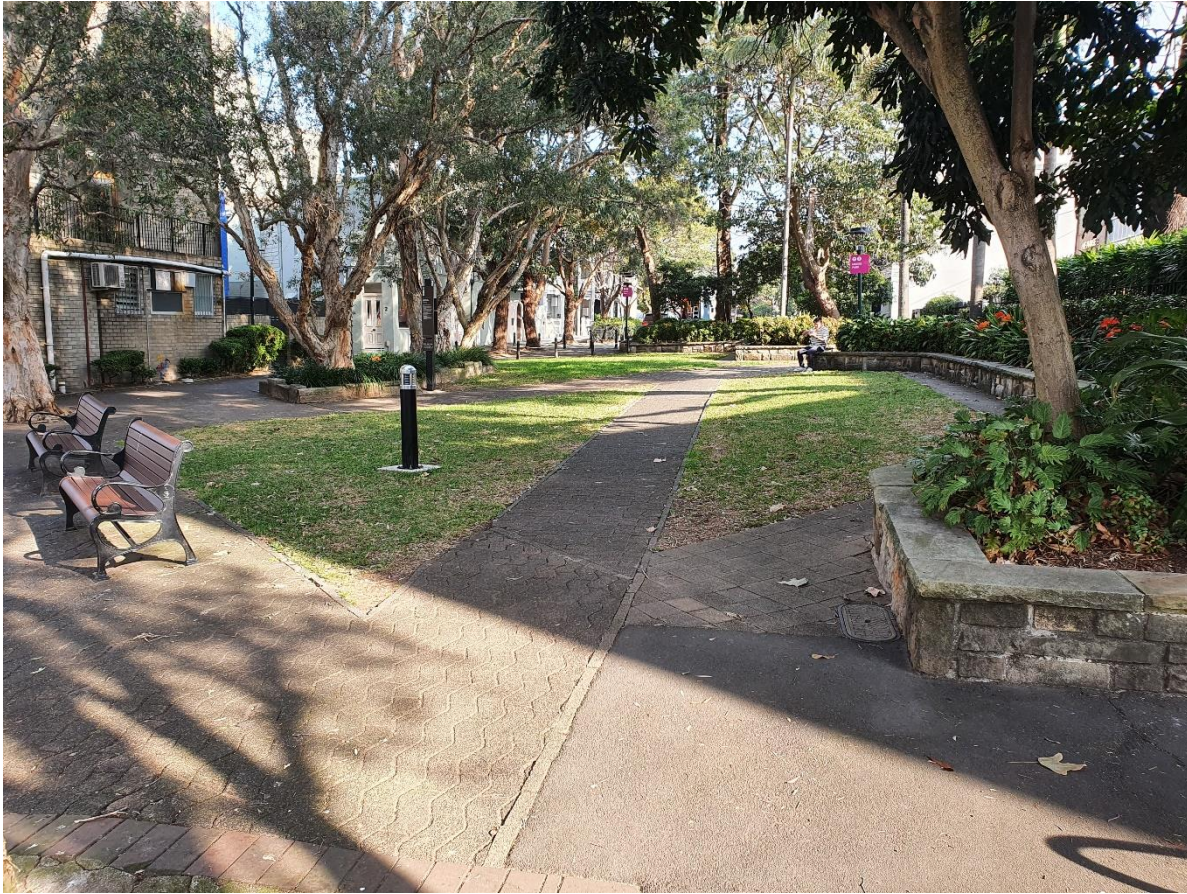
Existing reserve looking south towards the rear of the site. The paving is at the end of its lifecycle. The turf is worn on the corners due to pedestrian movements. Sandstone planter bed retaining wall needs some maintenance to extend life. Mature trees fill the site and provide ample shade to the space.