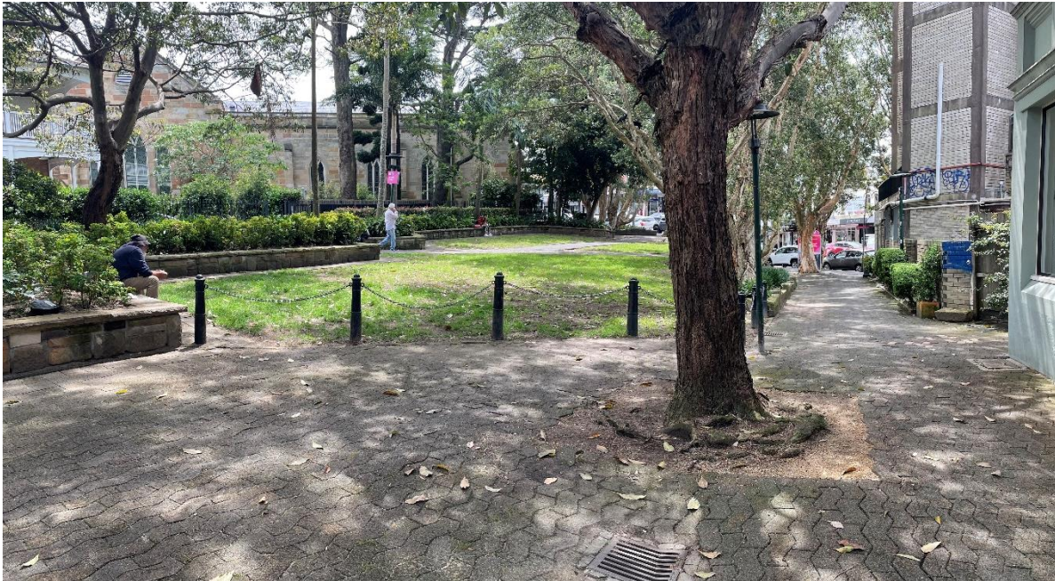
Looking north towards Oxford Street from Regent Street. Uneven paving caused by the trees. Bollards stopping unwanted movement on to grass. End of life lighting and stormwater visible.